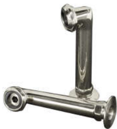
6" Elbow Mounts

BP Polished Brass PN Polished Nickel CP Polished Chrome SN Brushed Nickel ORB Oil Rubbed Bronze